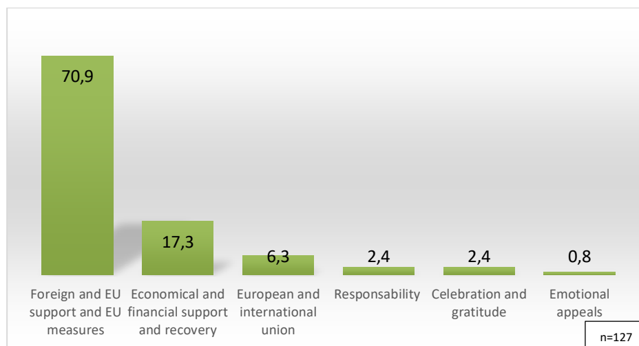
Figure 1. Thematic categories mentioned in Ursula von der Leyen’s tweets (%)

The substance of Ursula von der Leyen’s tweets mainly comprised mentions of the following thematic categories: foreign and EU support and EU measures (70.9%), economic and financial support and recovery (17.3%), and European and international union (6.3%). Less frequent mentions were also made of responsibility (2.4%), celebration and gratitude (2.4%), and emotional appeals (0.8%). These results are presented graphically in Figure 1.