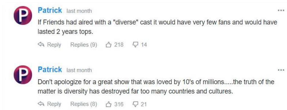
Figure 5. "Twitter user Patrick on Friends and diversity." 2020.

Even as cancel culture and diversity initiatives may overlap, they are not the same. Cancel culture is a consensus to end taboos, whereas diversity initiatives constitute an attempt to add new perspectives to an otherwise homogenous creative landscape. Even still, there are audiences who believe that diversity initiatives are a type of cancelling, or destruction, of creativity (Figure 5).