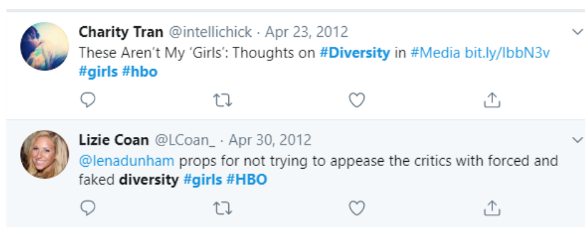
Figure 1. “Girls criticism and praise on Twitter.” Screenshot from Twitter. 2020.