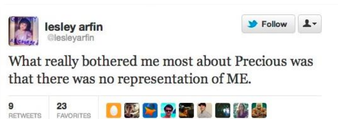
Figure 3. "Girls staff writer Arfin on Precious film." Screenshot from Twitter. 2020.

Diversity and nepotism were not the only controversies to haunt the show in audience and critical circles, though they were two of the most prominent and persistent. Other controversies include depictions of nudity and sex acts. The web magazine Vulture chronicles all the controversies on their website, from 2012-2017 (Moylan, 2017). Interest in the show from critics and audiences was high. Notably, "the New York Times ran seven articles per week during the show's first three months" (Watson, 2015, p. 145). Dunham, as the main character Hannah, even reflects satirically on her role as "the voice of my generation" versus "a voice of a generation" (S1x1, "Pilot"). This could be because, months before the show aired, critics were already lauding Girls as "important" and a modern instantiation of feminism, which was assumed to be global feminism. Instead of including intersections on gender, race, and class in a way that was supposed to be "highly current, and thoroughly modern" and "unlike what was on TV" (Stewart, 2012, para. 7), the show released promotional posters featuring a cast of four white young women. The white feminist narrative seemed reminiscent of what viewers had seen from Sex and the City fourteen years earlier, and so the progressive expectations for the show did not meet with the show's creative reality.