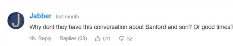
Figure 6. "Twitter user Jabber on diversity critiques." Screenshot from Twitter. 2020.

Diversity initiatives may also be perceived as unnecessary because all-black casts in similar shows promote a “separate but equal” ideal. As seen in Figure 6, Twitter-user Jabber questions why minority-centric shows are not questioned for their lack of diversity.