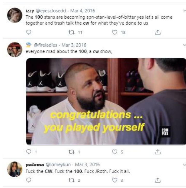
Figure 4. "The 100 fans' Twitter discontent." Screenshot from Twitter. 2020.

Rothenberg heard from upset viewers across various social media. By that time, The 100 was notorious for killing off central characters, and did so with Commander Lexa in the episode “Thirteen” (S3x7). After this episode aired on March 3, 2016, viewers vented their disappointment on Twitter, as shown in Figure 4.